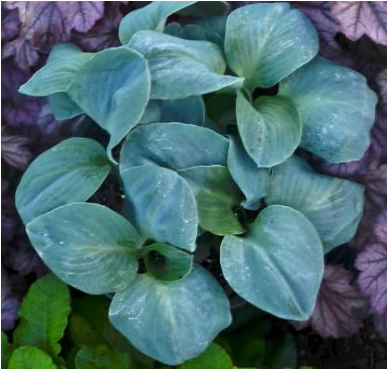
H. 'Blue Elf' Mini NR