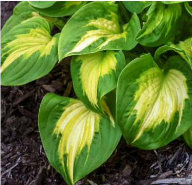
H. 'Etched Glass' Large Registered by Walters Gardens in 2018. Sport of H. 'Stained Glass' .

Thick, heavily corrugated leaves. PPAF CPBRAAF