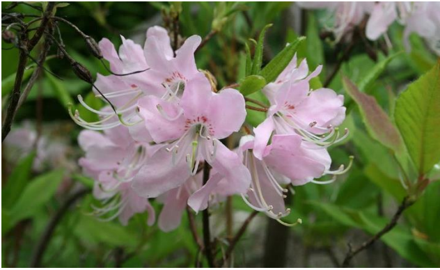
Above. Rhododendron vaseyi . Right. Rhododendron prunifolium .

Come and travel with Jim as he searches for native azaleas in the Southern Appalachian Mountains. Learn about native azaleas and where they can be found. Our native azaleas are a national treasure and are worthy additions to our gardens. Starting in early spring with R. vaseyi and ending with R. prunifolium in late summer, native azaleas bloom in many colors. Several species are very fragrant.