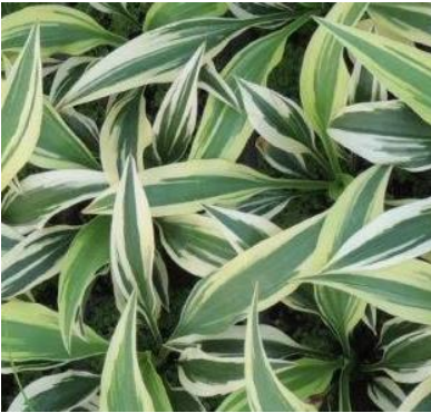
H. 'Bright Star' Medium NR