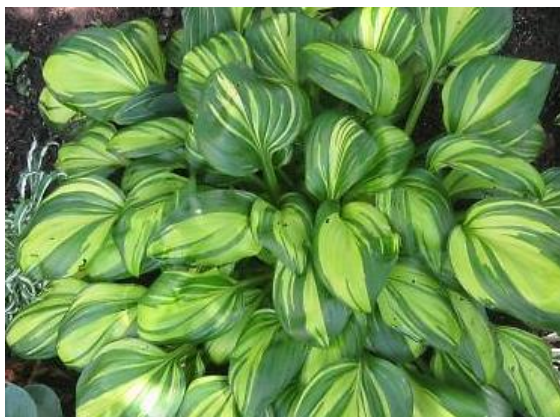
H. 'Rainbow's End'