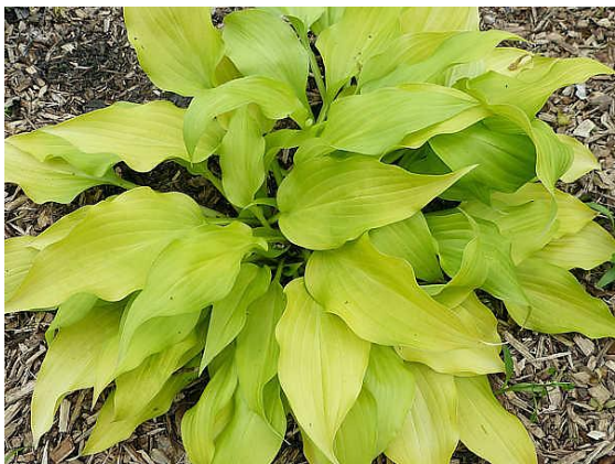
H. 'Pot of Gold'