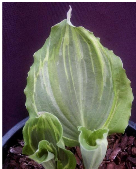
H. 'Sharon Stone'.