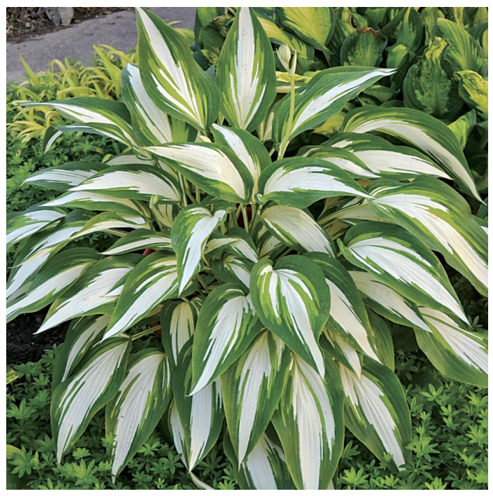
H. 'Cool as a Cucumber'. Walters Gardens, 2012.

Cover and chill for several hours. Before serving, check for consistency, gradually adding another 1/2 to 1 cup cold water or broth to thin the soup if necessary. Add more lemon juice and salt if needed and serve.