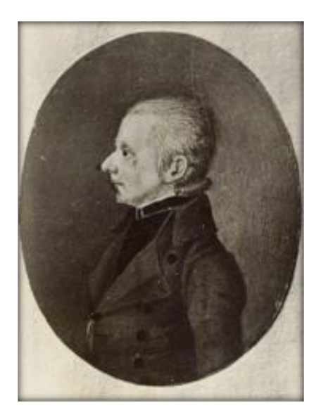
Do you know who this man is?

Hint: His name appears from time to time in our Newsletter .